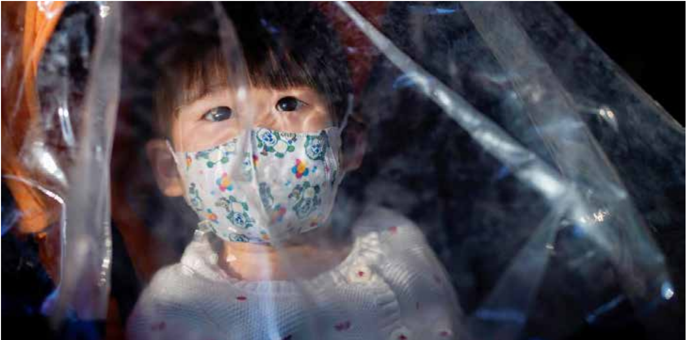
Chinese kid with a face mask

Meanwhile African oil exporters are in double agony as apart from the coronavirus drawback, an escalating oil price war has taken off with Saudi Arabia announcing that it will supply the oil market with 12.3m barrels a day beginning April. This is 2.5m barrels a day more than what it was producing before and will flood the market leading to further drop in the price of oil from the current low of $36 per barrel, which is devastating news to African oil producers already reeling from the low demand and price for the commodity thanks to coronavirus. A scenario projected by the UNECA shows that even if the same volumes of barrels of oil are exported in 2020 as in the period 2016-18 and the price is pegged at $35, the impact of the coronavirus and price wars will make revenue for Africa exporters fall to $101b, a loss of over $65b. Indeed, the price wars resulting from tensions between Saudi Arabia and Russia, two major oil producers,