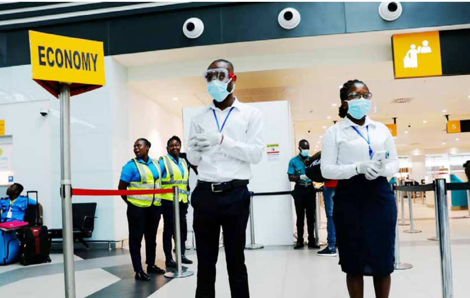
Health officials at Kotoka International Airport, Ghana